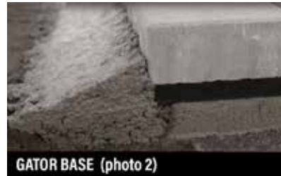
GATOR BASE (photo 2)