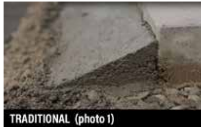
TRADITIONAL (photo 1)

Always refer to the latest GATOR XTREME EDGE Technical Data Sheet (TDS) at Flex-lock.com before installing GATOR XTREME EDGE . Concrete pavers, slabs, Natural and Wet cast stones should be installed according to ICPI Tech Spec 2 and ICPI Tech Spec 10 , utilizing industry established best practices for the base, setting bed, and drainage of a hardscape project.