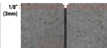
PAVERS OR NATURAL STONES WITH CHAMFER

POLYMERIC SAND REQUIREMENTS Minimum joint width: 1/8" (3 mm) Maximum joint width: 1" (2.5 cm) Minimum joint depth: 1 1/2" (38 mm)